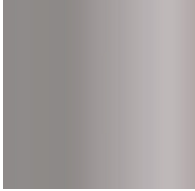
Matte White Lacquer - MWL